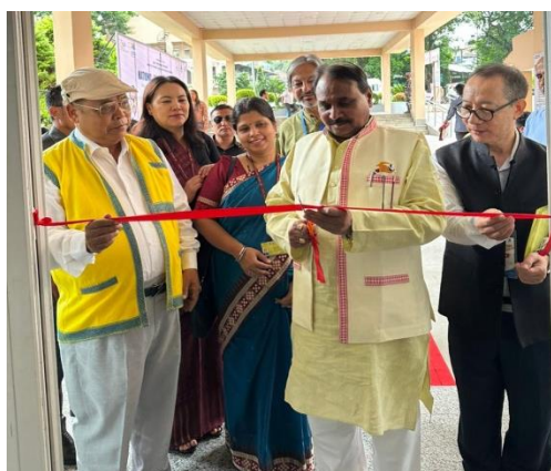
Shri Bhanu Pratap Singh Verma Hon'ble Union Minister of State inaugurating exhibitions at NSSH Itanagar Conclave, Arunachal Pradesh along with Shri Tumke Bagra, Hon'ble Minister of Industries, Government