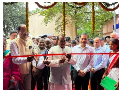
Shri Bhanu Pratap Singh Verma, Hon'ble Union Minister of State, MSME inaugurating exhibition at Gumla Conclave