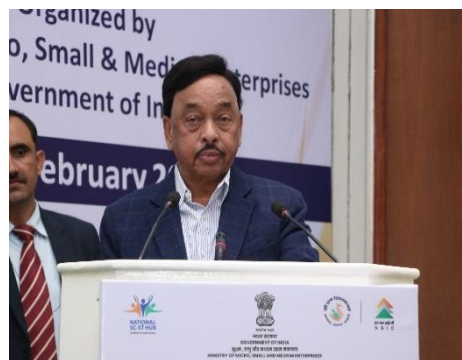
Shri Narayan Rane Hon'ble Union Minister MSME keynote address at CPSE Conclave

In addition, CPSE Conclave on Public Procurement Policy, GoI – Resilience to Resurgence has been organized on 29 th February 2024 at Vigyan Bhawan, New Delhi. The Conclave was organized with the objective of sensitizing, recognizing, and felicitating the efforts of CPSEs towards fulfilling the mandate of the Public Procurement Policy. The Conclave has been attended by more than 172 officials representing 100+ CPSEs along with dignitaries from the Ministry of MSME. Selected CPSEs were awarded for their exceptional performance across various categories during the CPSE Conclave.