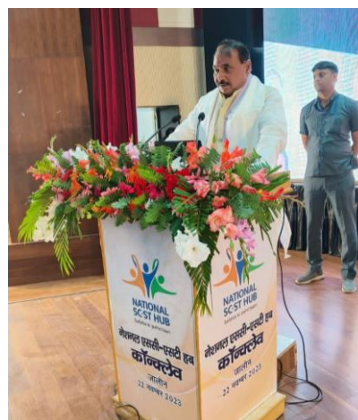
Shri Bhanu Pratap Singh Verma Hon'ble Union Minister of State addressing the audience during NSSH Conclave at Jalaun.